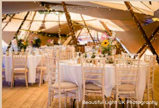
Beautiful Light UK Photography