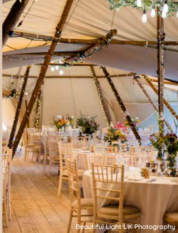
Beautiful Light UK Photography