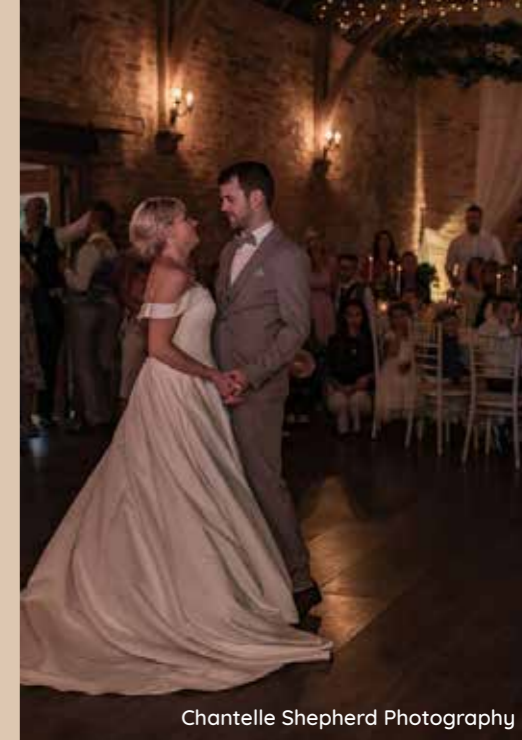
Chantelle Shepherd Photography

DOVECOTE BARN has a capacity of up to 140 for your evening reception and THE TIPI up to 200.